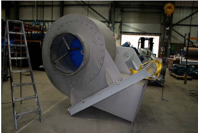
A Becoflex BF 130 ready for shipment.