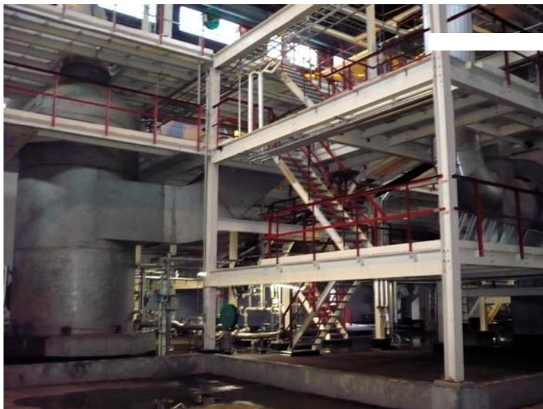
The Becoflex Discharge Vessel with single tangential inlet duct