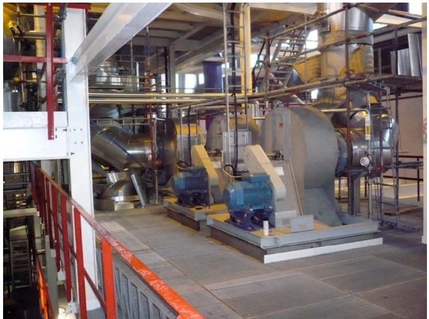
The 2 x Becoflex BF 114 Installed above the A.N. Granulator Dryer